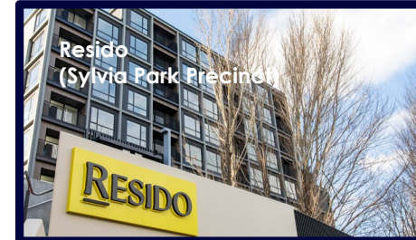
Resido (Sylvia Park Precinct)