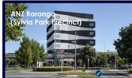
ANZ Raranga (Sylvia Park Precinct)