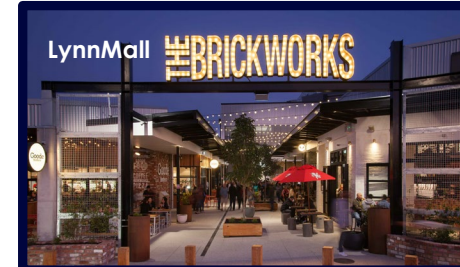
LynnMall THE BRICKWORKS