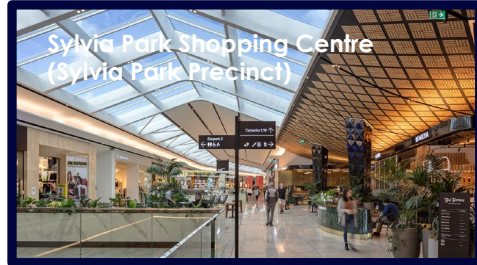
Sylvia Park Shopping Centre (Sylvia Park Precinct)