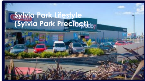
Sylvia Park Lifestyle (Sylvia Park Precinct)