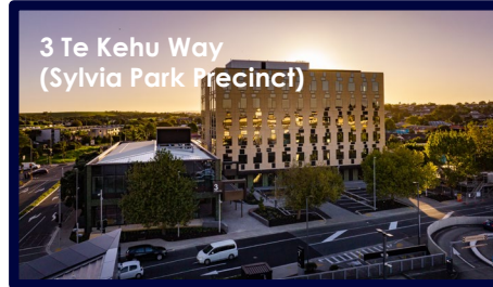
3 Te Kehu Way (Sylvia Park Precinct)